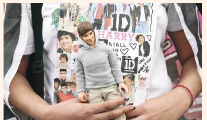
A fan holds a doll looking like the late British singer Liam Payne as she attends to pay tribute at the Obelisco in Buenos Aires on October 17.

Macau's most popular English-language newspaper – Your trustworthy source of news & views