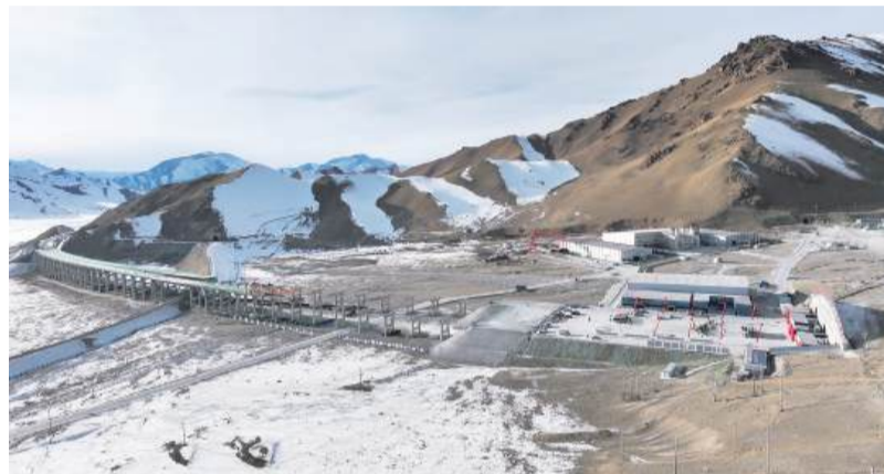
This aerial drone photo taken on yesterday shows the exit of the Tianshan Shengli Tunnel and a nearby expressway which is under construction in Hejing County of Mongolian Autonomous Prefecture of Bayingolin, Xinjiang Uygur Autonomous Region.

The Tianshan Shengli Tunnel stands as a landmark