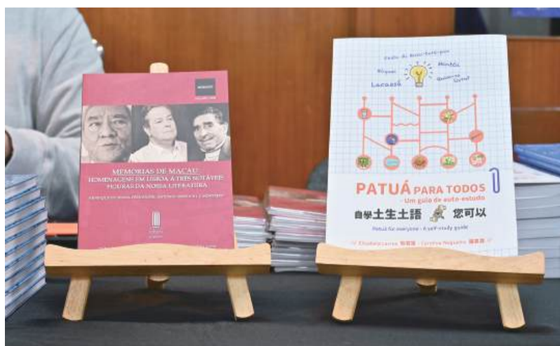
This photo shows both the “Patuá for everyone – A self-study guide” (right) and the “Memories of Macau: Homage in Lisbon to three notable figures of our literature”.

Complete with graphics and easy-to-understand explanations, the self-study guide comprises eight themed